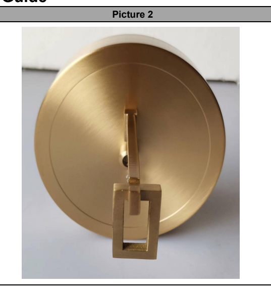
Step 1:Fix C on top of B as shown in the picture.