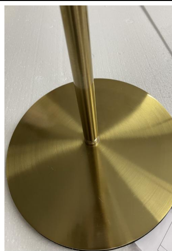
Step 1: Fix the light body on the bottom seat as shown.