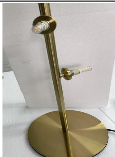
Step 3: Install the G9 light source.