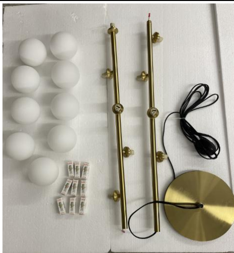
Parts List: as the picture shows.