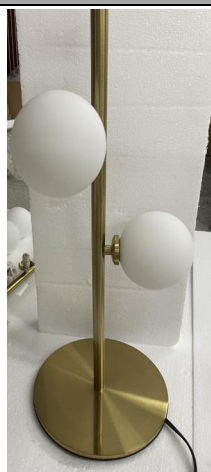
Step 4: Install the lampshade.