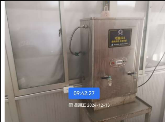
Description/Area: Production building Comments: Drinking water