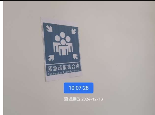
Description/Area: Production building Comments: Emergency point