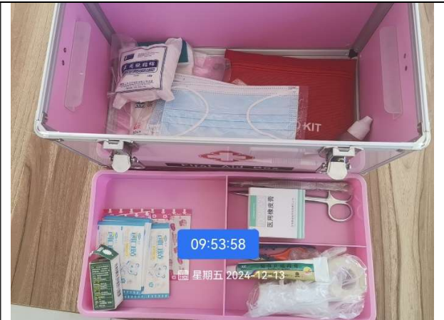
Description/Area: Production building Comments: First aid box