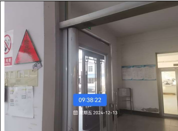
Description/Area: Production building Comments: Safety exit