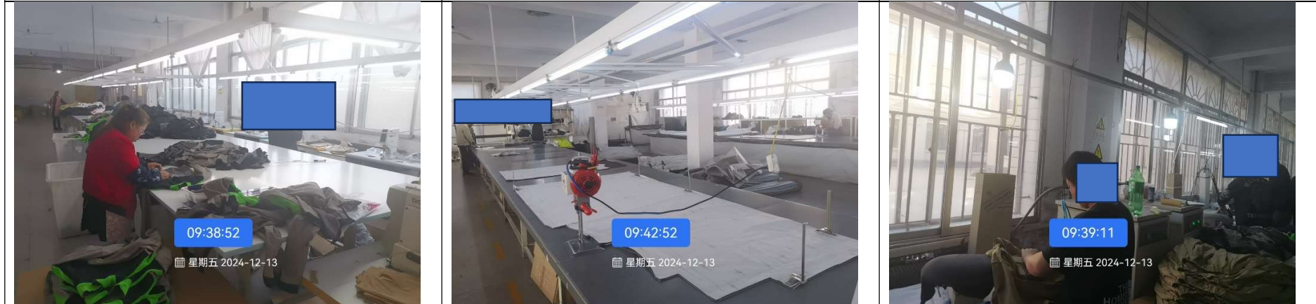
Description/Area: Inspection and packing workshop Description/Area: Cutting process Description/Area: Ironing process Comments: Comments: Comments: