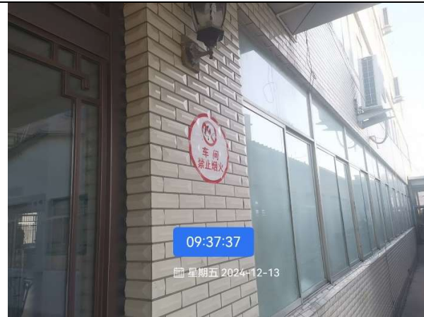
Description/Area: Production building Comments: No smoking sign