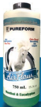
750 ml (25 oz)

Oral syringe 1/2 oz (15 - 20 ml) of liquid AirFLOW once or twice daily until normal activity and healthfulness returns.