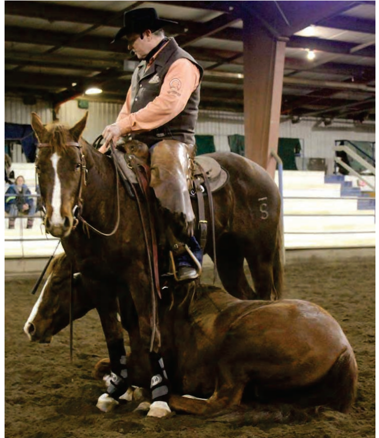
Multi-World Champion Trainer - Doug Mills & Studs (TrainingThruTrust.com)